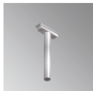
PTBRR18-SS Post top bracket