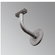
WBRR18-SS Wall bracket