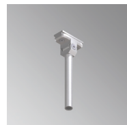
PTBRR18-SS-A Adjustable post top bracket